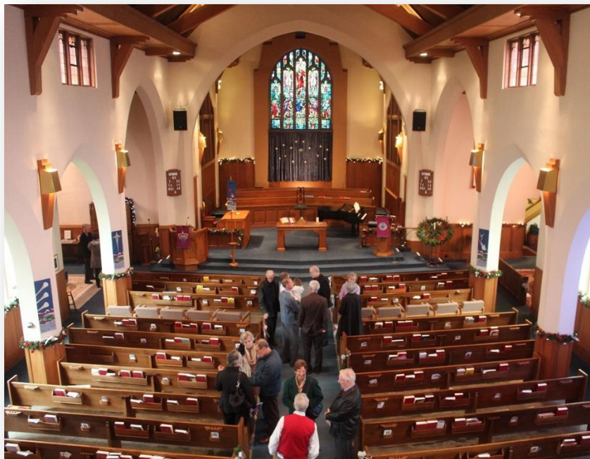
A SMALL ADVENT GATHERING DURING FOLLOWING WORSHIP.