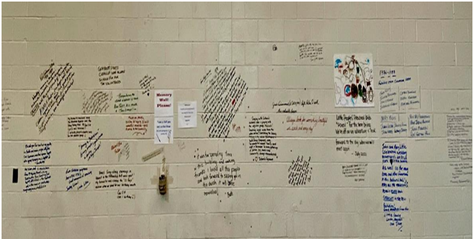
AUGUST, 2021...FINAL GOODBYE TO THE FELLOWSHIP CENTRE AND MEMORY WALL SIGNING