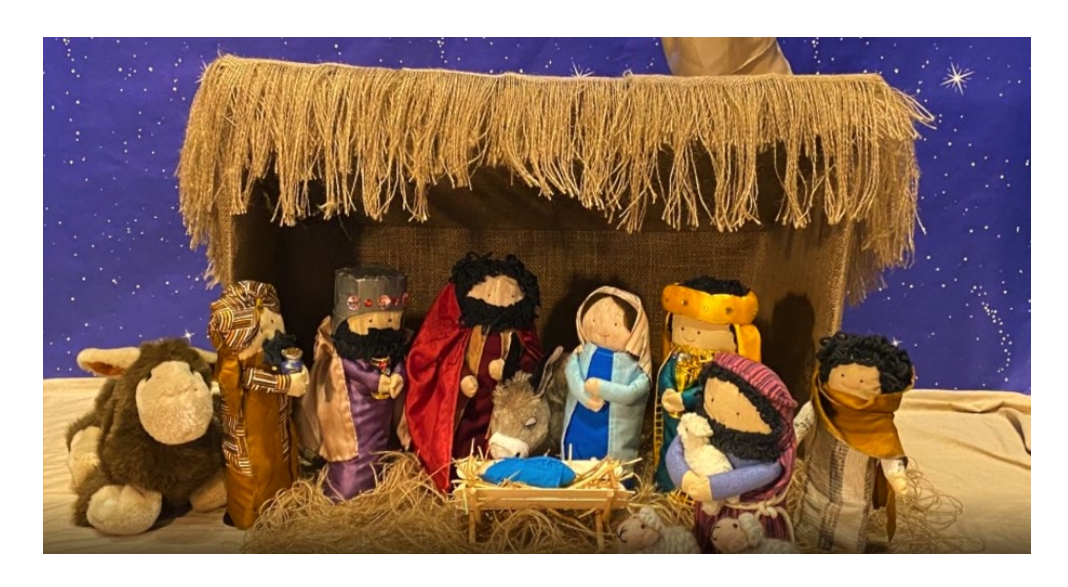
Christmas Creche See Worship p. 11