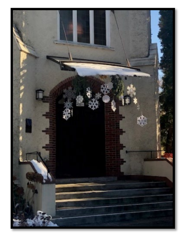
Blanket Knox in Love See KnoxVan Events p. 14